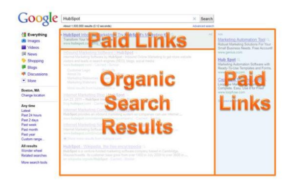
Figure 4. What is SEO?

Searching is the most basic information tool in the Internet. By taking new search engine technologies, digital information can be accessed with ease. Using a search engine to explore can help enterprises and consumers locate target information within seconds, largely improving business efficiency. Keyword searches are one of the most elementary applications of online searching. With the better performing computing power, storage capacity and network speed currently available to us, we have access to advanced methods in searching. For example, users can search information by voice or visual search. From the perspective of enterprises, for many years, people from digital marketing have been continuously optimizing search engines. In fact, search engine optimization (SEO) has always been one of the important tools to increase online views for enterprises. For users, they have access to more accurate information in line with their own needs. However, effects of traditional means like optimizing the webpage and buying keywords may be waning Mobile technologies, voice recognition and big data can help computers retrieve a mass of the Internet, social media and geo-location data. Based on the filtration and categorization of the data, computers can more accurately predict the future requirements and behaviors of users (Kotler, M., Cao, T., Wang, S., Qiao, C., 2020).