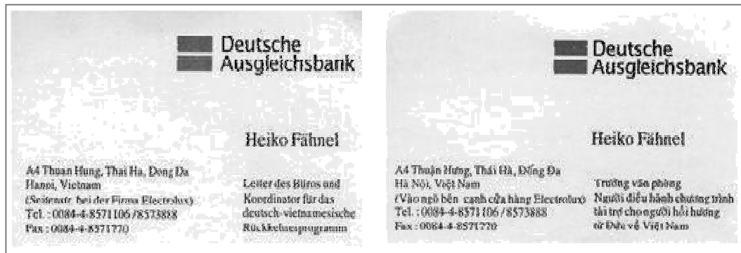
Figure 1. Forms of Address - Chinese Names