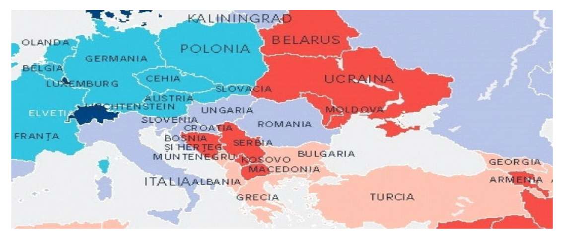
Figure 1. The map of the political component of the country risk for the European countries

The study evaluates 178 countries based on three categories: political, macroeconomic, and operational, being ranked by means of a value from 0 to 100, the political risk for each country on the European continent being presented as follows: