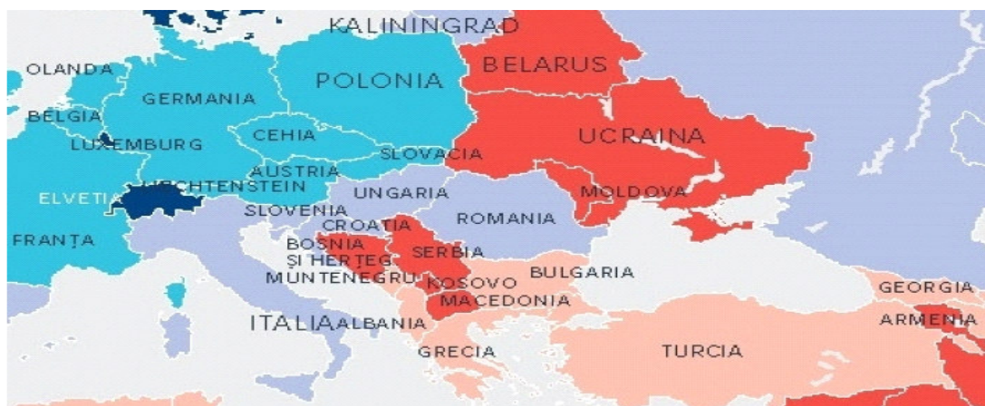
Figure 1. The map of the political component of the country risk for the European countries

The study evaluates 178 countries based on three categories: political, macroeconomic, and operational, being ranked by means of a value from 0 to 100, the political risk for each country on the European continent being presented as follows: